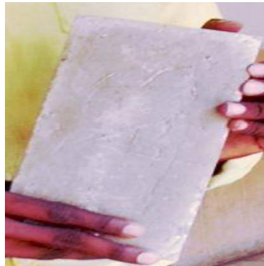
Fig 4.3(c) After demoulding