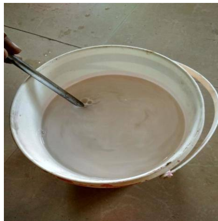
Fig 4.2(c) Alkaline solution