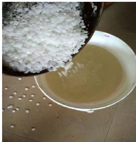
Fig 4.2(a) Adding sodium hydroxide to dissolved H 2 O

component. The solution is normally soapy in nature and even a single drop of solution fall on the skin it may cause a skin irritation. Hence proper care should to be taken while handling the solution.