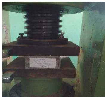
Fig 5 Test for compressive strength

The compressive strength test is conducted to find the load bearing capacity of material. The compressive strength test is done by CTM for 3, 7, 14 and 28 days of self curing.