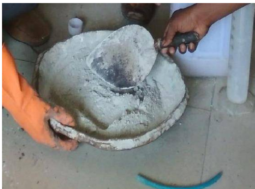
Fig 4.3 (a) While mixing

The materials like flyash, GGBS, copper slag and M sand is mixed in dry condition and it is kept for kneading of about 3 to 4 mins. After this the alkaline solution is added to the dry mix and mix well upto its consistency. The mixture is allowed to fall into the mould and the mixture is compacted in three layers. Each layer 25 number of blows has to be given with the help of rammer. And finally the brick is demoulded and kept for self curing.