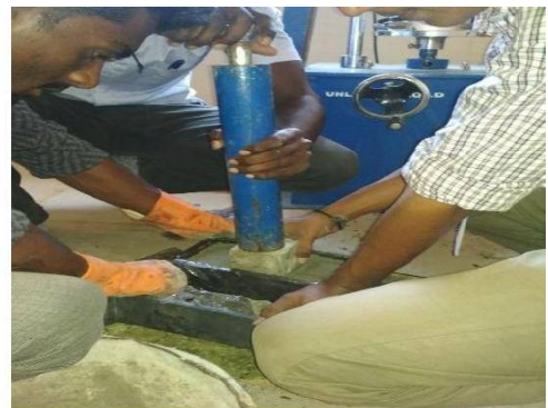
Fig 4.3(b) While compaction