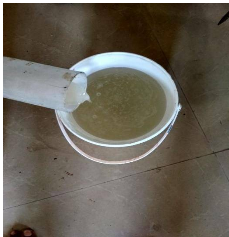
Fig 4.2(b) Adding sodium silicate

Mass of aggregate for one brick = 2166.34 gms in various proportion.